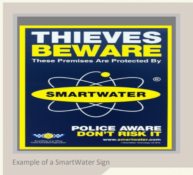
Example of a SmartWater Sign

Each kit is charged for and returning it will result in a credit to the company allowing another church to use it at no additional cost.